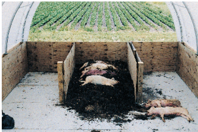
One thousand pounds of pigs added in two layers.