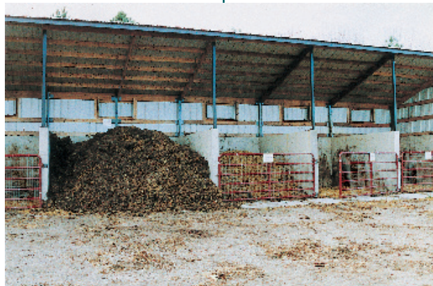
Multiple bin composting structure; note gates on fronts of bins.