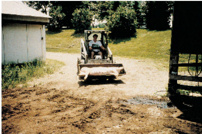
Transporting dead sow to composting structure.