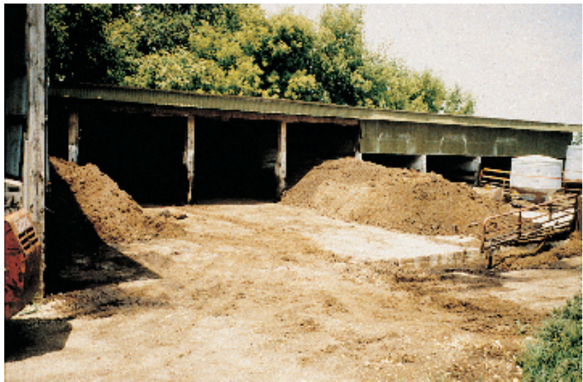
New three bin composting structure.