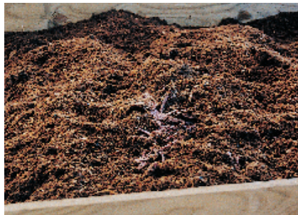
Appearance of carcasses after first heat cycle.